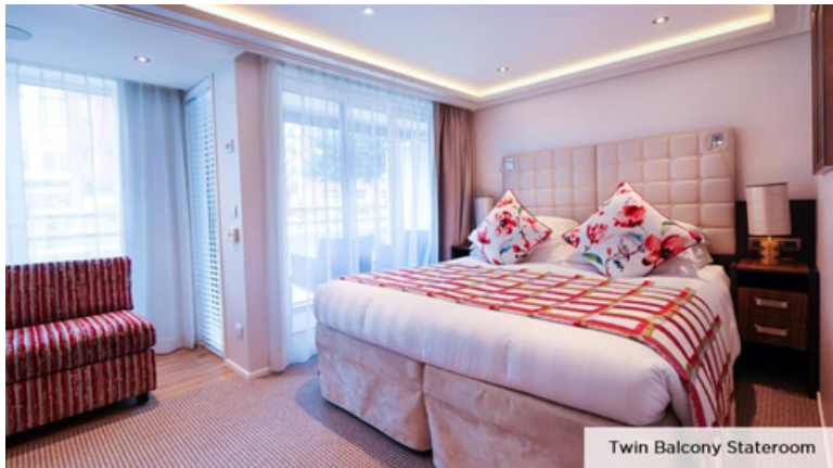
Twin Balcony Stateroom

7-night cruise | October 24-31, 2026 | Aboard AmaSiena